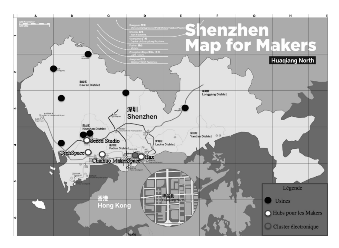
Figure 2. Map of the Makers' Ecosystem (source HaxLR8R, modified by the authors)

resulting in highly innovative initiatives.